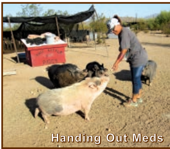
Handing Out Meds

need extra time or can't behave (that's you, Macy!). The rest of the herd eat their grain from troughs and bowls and are free to go from one to another as they please. We do monitor the pigs during their feeding time to ensure that no one is hanging back or getting pushed out of a trough. All the pigs get their fair share. Afterwards, alfalfa hay is spread out in clumps across the field for all the pigs to graze on at their leisure. They tend to have their favorite spots to eat their hay. Some of them are on medications that are handed out wrapped in peanut butter sandwiches. The "med pigs" will