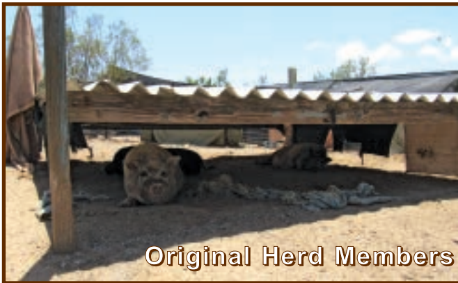
Original Herd Members

getting along fine with the other pigs, but there are certain people on staff that she doesn't particularly care for. Following them around and being a nuisance