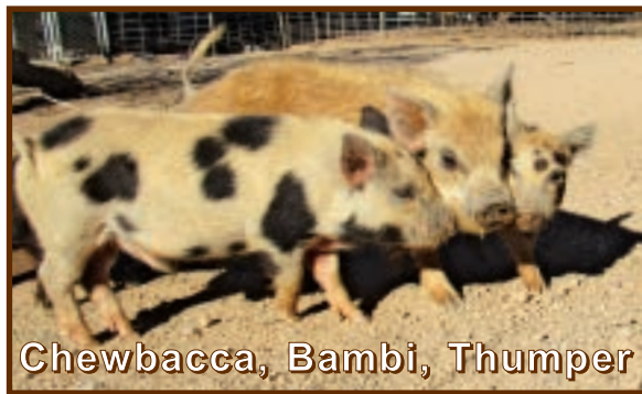
Chewbacca, Bambi, Thumper

also did great with the surgeries and had quick recoveries. The