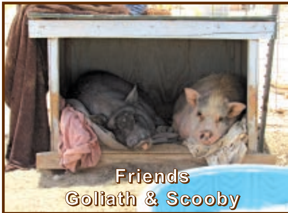
Friends Goliath & Scooby

weeks staying in a house off in the corner alone then suddenly go back to using one in a row of occupied homes where she has close neighbors. Scooby and Goliath are best friends and