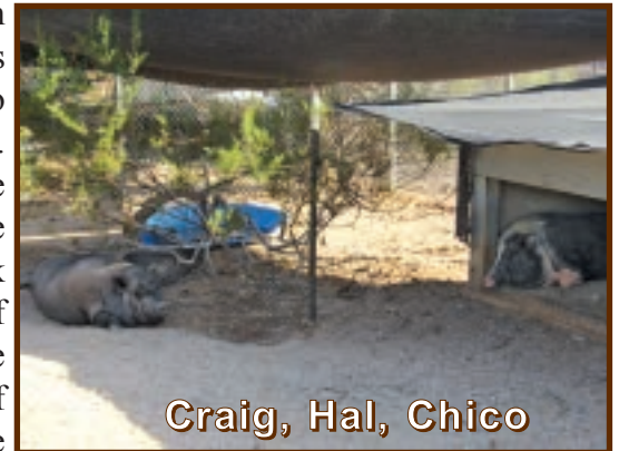
Craig, Hal, Chico

Reba and Craig are still the quiet ones of the bunch. They both drift in and out of the main hangouts for the new pigs but spend much of their time on their own. That is typical of pigs that were raised as an “only child” in a household. It usually takes them longer to feel comfortable in a group setting or to form a