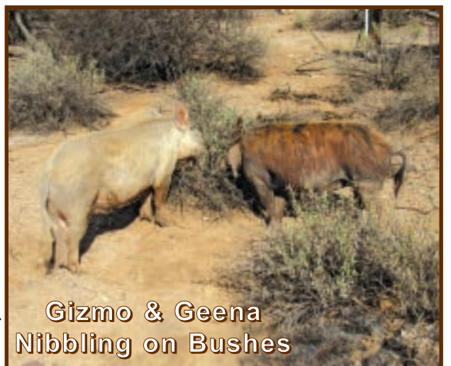
Gizmo & Geena Nibbling on Bushes