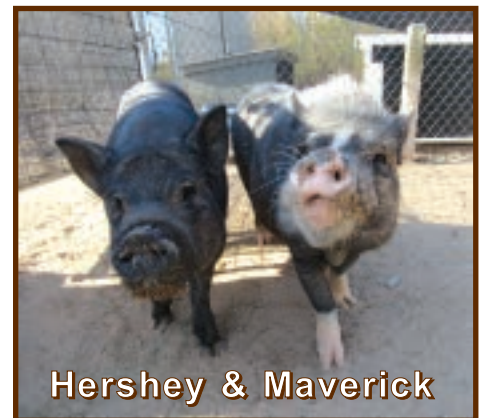
Hershey & Maverick

the West herd. Maverick and Dexter in particular took a major disliking to one another. We were continuously breaking those two apart in the middle of a fight. Within a week Dexter was injured bad enough that he had to be taken out of the field and returned to the holding pens for recovery. It just wasn't going to work having those two in the same area, so Dexter would not be