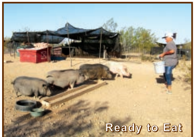
Ready to Eat

feeding team arrives at Comanche's Field which is the first one fed each morning, the first task is to put Macy in her individual feeding pen before she can start pushing the other pigs