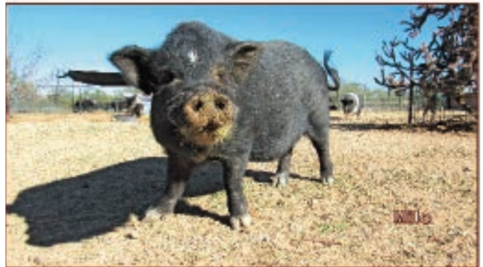
Page 16 IRONWOOD PIG SANCTUARY Issue 14