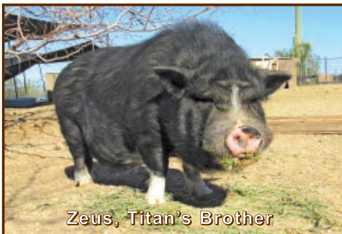
Zeus, Titan's Brother