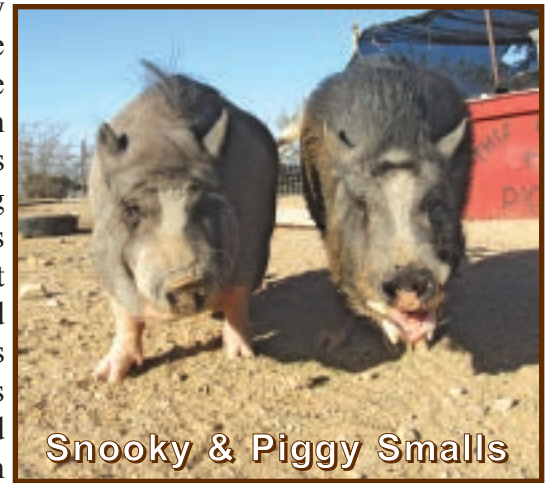
Snooky & Piggy Smalls

Gracie and Belinda are similar to Jasper in personality. They too like having their own space and time to themselves. Yet all three