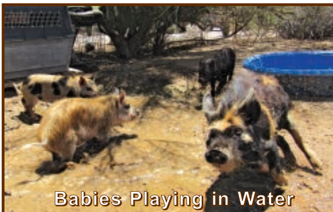
Babies Playing in Water

D uring April and May of 2018 little by little we were able to rescue 12 small hogs of various ages from a terrible home where they had insufficient water due to the well drying up, very little food, no medical care and deplorable living conditions. They came from a small rural town about 1.5 hours south of the sanctuary. Unfortunately, the authorities who investigated the situation deemed the home “good enough” and would not allow the remainder of the pigs to be saved. Then on June 28th we received word through the sheriff’s department of yet another matter involving 12 more pigs totally unrelated to the previous rescue but located in the same town. These pigs, a mix of pot-bellies and Kunekunes, were in a little better shape than the previous dozen, but their owner was being arrested for undisclosed charges. An investigation by the Pima County Sheriff’s Department along with