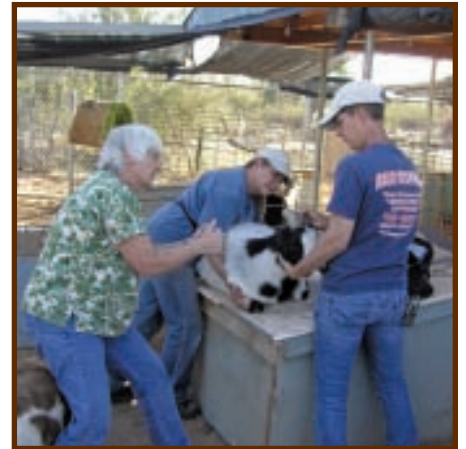
Trimming Dale Jr's Horns