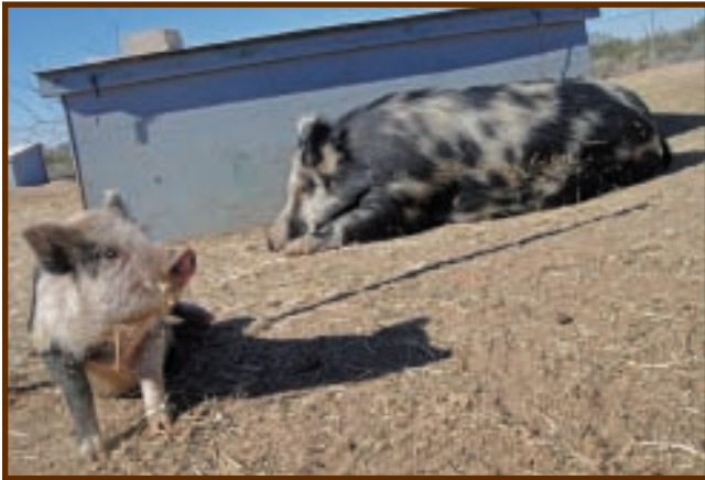
Dexter And His Best Friend Jeannie

than a potbelly. From the first day we saw Dexter we made the connection and felt that he might grow to be as big as her. We thought it'd be nice if they could