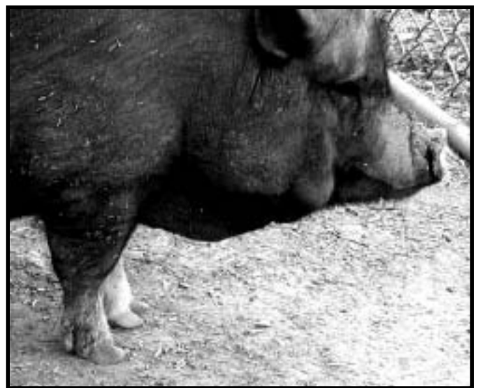
Sassy's Hooves Today