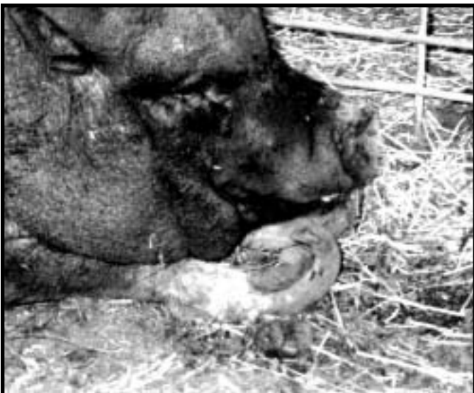
Sassy's Hooves The Day She Arrived at Ironwood

Tusk and hoof trimming should not be attempted at home until an experienced trimmer has trained you. Without proper training, you could be placing yourself and your pig at risk for an injury. If you don't feel comfortable doing your own pig's hooves or tusks, your pig's vet can perform this task for you.