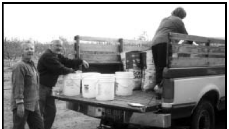
Picking Up Donated Apples From Wilcox