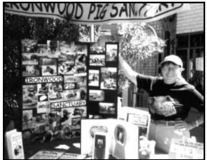
Ironwood at the Fourth Avenue Street Fair