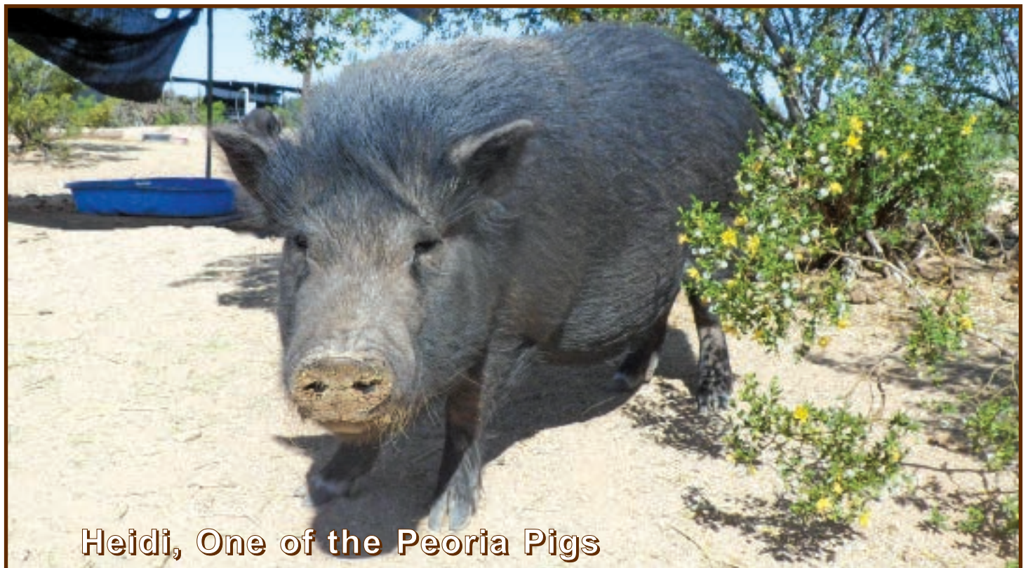
Heidi, One of the Peoria Pigs